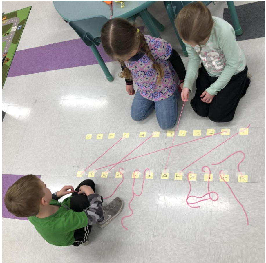
Top Left Clockwise: WATCH DOGS, Prek letter naming activities